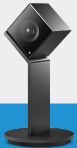
HP Presence See 4K AI Camera 14